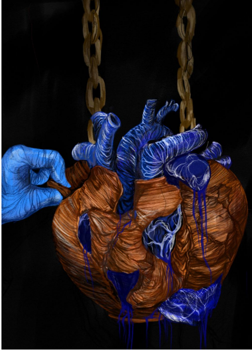
Hannah Chang - □□□□ (Dripping water wears stone)