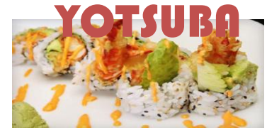
Because sushi, that's why.

Seeing as it's a burger tavern, you should probably try their burgers. (You won't regret it!)